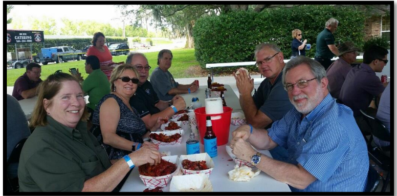
Another fabulous Crawfish Boil under the Oaks! April 2017 Rathborne Park, a hidden gem in Harvey.

The voice of the business community since 1946.